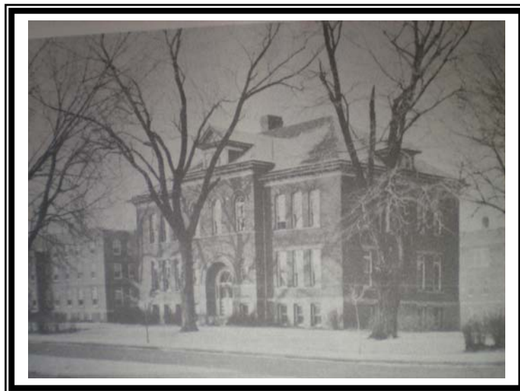
Jordan Science Hall – built in 1905

Jordan Hall is almost completed. Carpenters are putting in the stairways this week and they are fine ones. The building is finished in oak and makes a fine appearance.