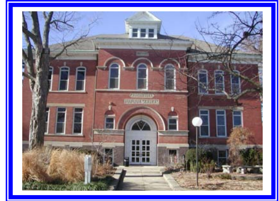
Central College Jordan Hall – Built in 1905

Annual Meeting, Monday April 9, 2012 @ 7:30 p.m at Pella's Opera House