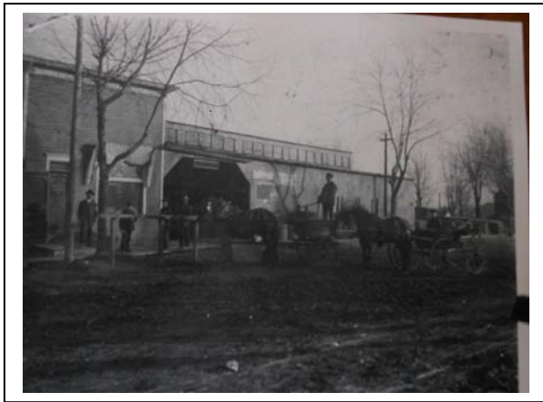
Kuyper Lumber Co. Founded 1892 at Broadway and Liberty Streets