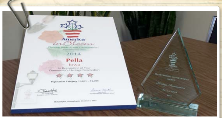
Outstanding Achievement Award for Heritage Preservation from America In Bloom