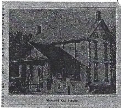
Diamond Oil Station