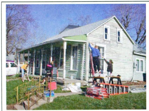
The Central volunteers hard at work.