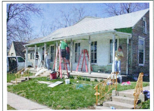
A clear but windy day made it a challenge.