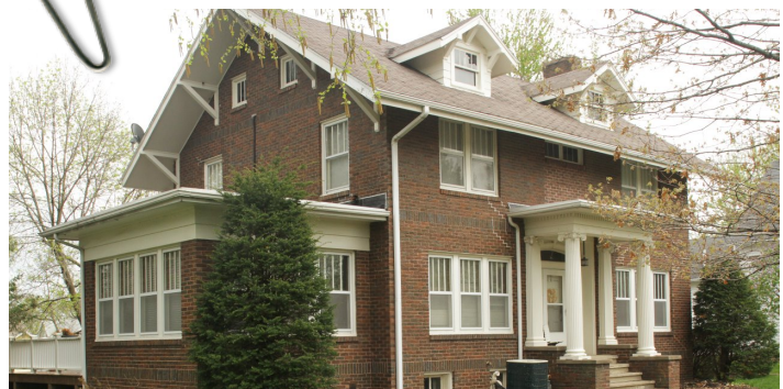
Horse-drawn Trolley Tours of Collegiate Historic District at 4:00, 4:30 or 5:00 pm.