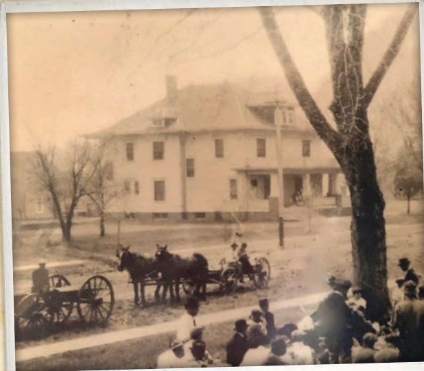
An early view of the Aldolphus Waechter home, later known as the Central College Boardwalk house.