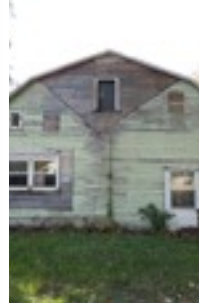
Restoring the original roofline beginning soon.