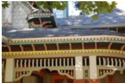
Establishing Pella's Collegiate Historic District