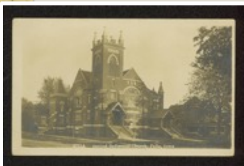
Second Reformed Church