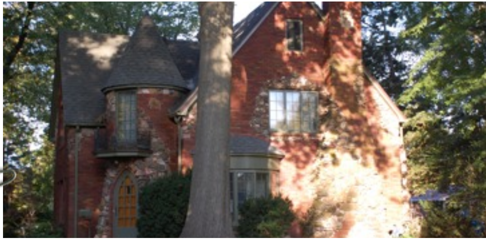
De Zee Meeuw: Hagens-Van Willigen House located at 1357 Main Street Pella, IA