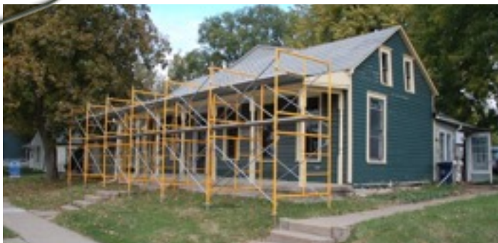
Scaffolding goes up as exterior restoration work begins at 1110 Washington.