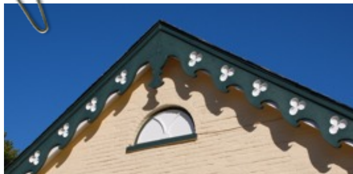
Soul Sleeper Church saved from demolition and now home of Pella's Used Bookstore.