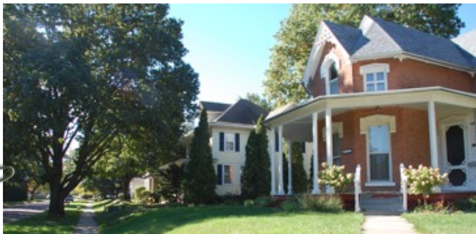
Homes along West 1st Street to be included in Pella's First Historic Collegiate Cultural District.

If you are interested in reading the letters in their entirety, please contact the Trust office.