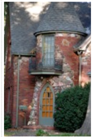
Front door & tower room